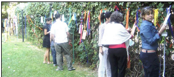
Honoring our mentors: Participants hung ribbons with the names of the people who had mentored them or encouraged them to work in human rights.